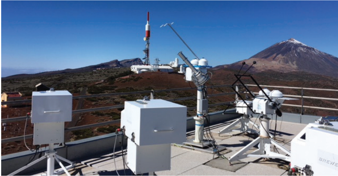
Figure 8: Instruments on the roof of the Izaña Atmospheric Observatory with Mt Teide in the background.

After his talk the participants visited the labs and the measurement platform on the roof of the observatory (Figure 8), where IARC scientists answered numerous questions.