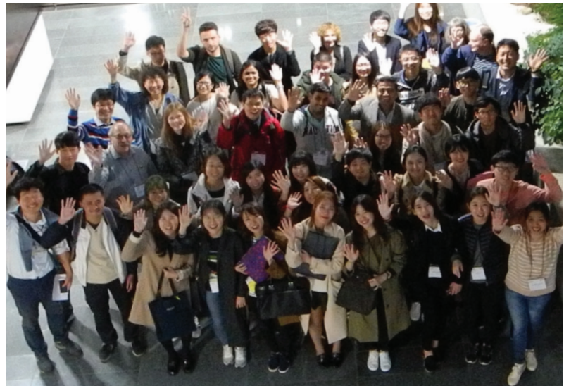
Figure 13: ECR event during the Local workshop 'WCRP grand challenges and regional climate change', Incheon, Rep. of Korea, 18-20 October 2017.

(ideally including one SSG member); and a dedicated (at least 1 hour) slot at SPARC SSG meeting where capacity development achievements to