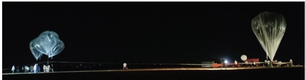
Figure 6: Photo of the launch preparation during the BATAL winter campaign conducted at TIFR Balloon Facility between 5-13 February 2018. The scientific package flown under a 3000 m 3 polyethylene balloon included 10 different payloads mostly dedicated to study clouds and aerosols.

TTL, our team recognizes that airborne measurements at high altitudes (14-20 km) from South to North India across the Asian anticyclone as well as near principal source regions (North East India, Indo-Gangetic Plain) would only be possible via aircraft measurements. The group recommends continuing airborne sample collection for laboratory chemical analysis and in situ optical measurements. Towards a future proposal to carry out an airborne campaign covering the UTLS region, a cost sharing agreement between NASA and ISRO will be discussed. In addition, a list of instruments will be identified for this future aircraft mission.