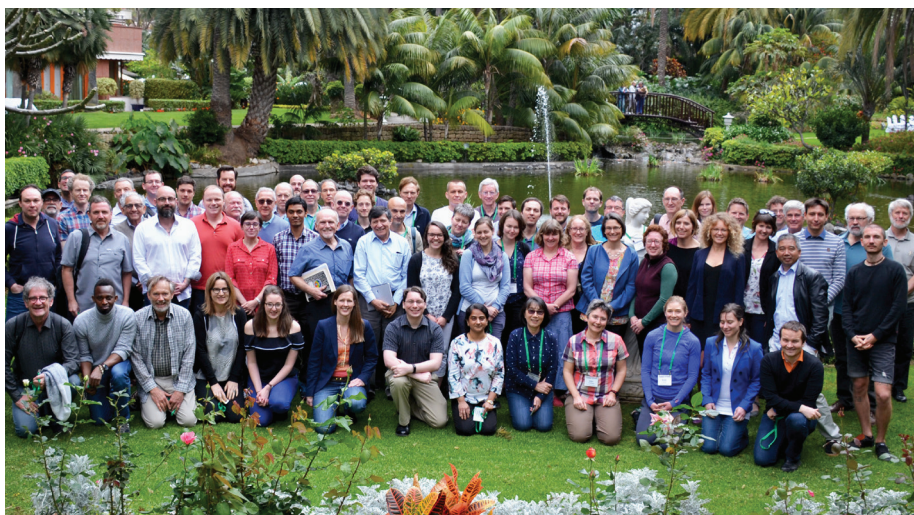
Figure 9: Group picture of the Chapman Conference attendees.

All presentations can be found on the SSiRC website: http://www.sparc-ssirc.org/