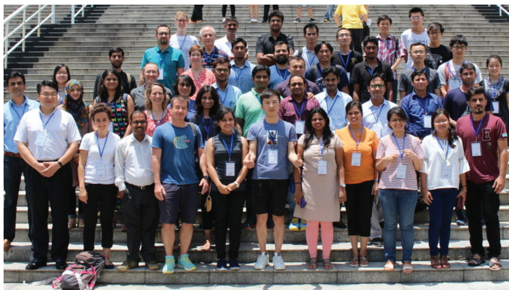
Figure 11: Participants of the 2 nd ACAM training school: 'Observations and Modeling of Atmospheric Chemistry and Aerosols in the Asian Monsoon', Guangzhou, China, 10-12 June 2017.

The goal of SPARC's capacity development activities has always been to ensure that scientific knowledge, methodological skills, and modelling expertise are developed in the regional and inter-