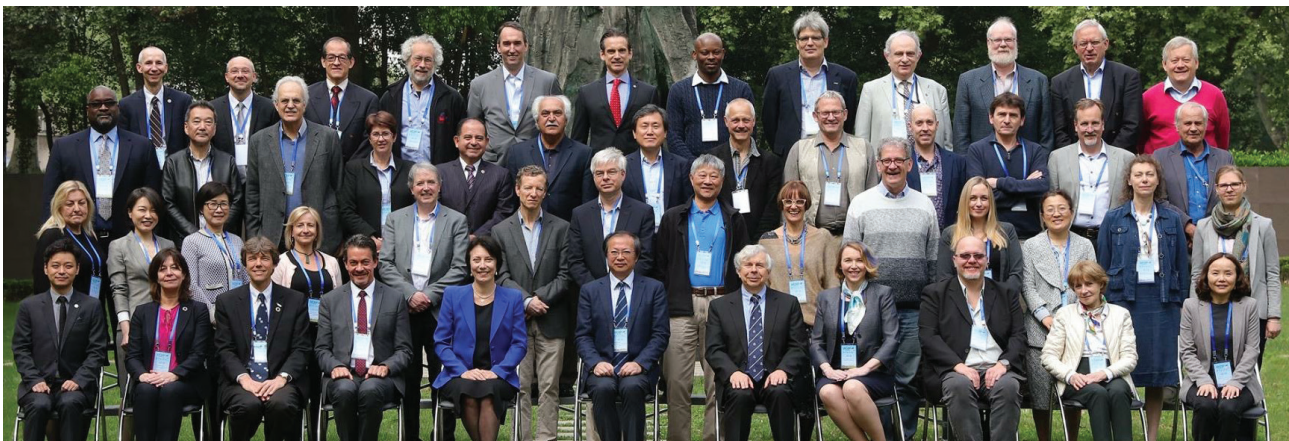
Figure 1: Participants of the JSC-39 session.