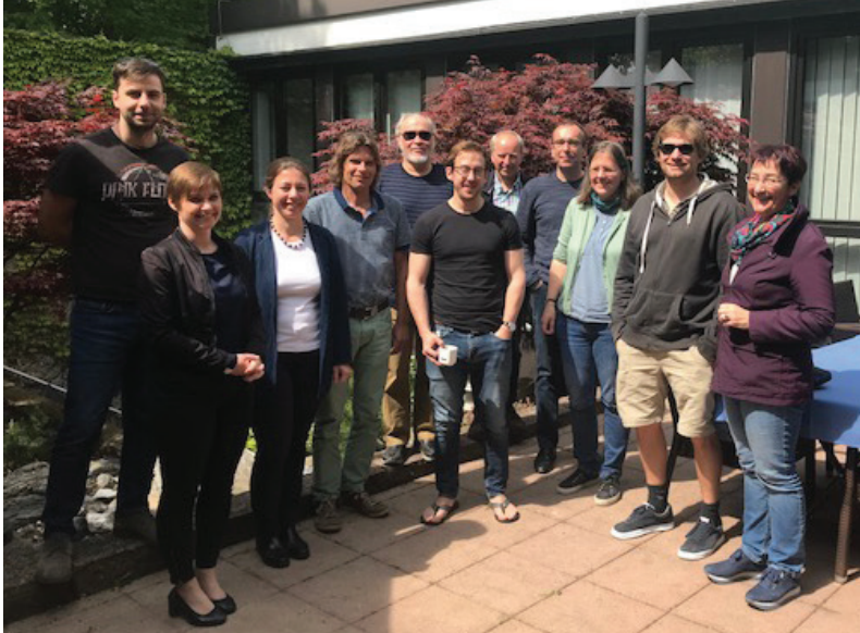
Figure 4: Participants of the SOLARIS-HEPPA Working Group Meeting, in Karlsruhe, Germany.

The meeting ended with a general discussion on the next steps of the working group activities, publication plans, and internal coordination. It was decided to hold a follow-up WG leader meeting in Karlsruhe (see below) in early 2018 in order to coordinate the next actions of the activity.