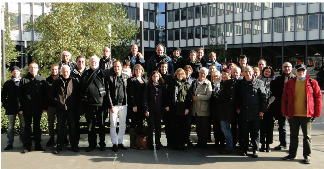
Figure 3: Participants of the SOLARIS-HEPPA Meeting in Paris, France.