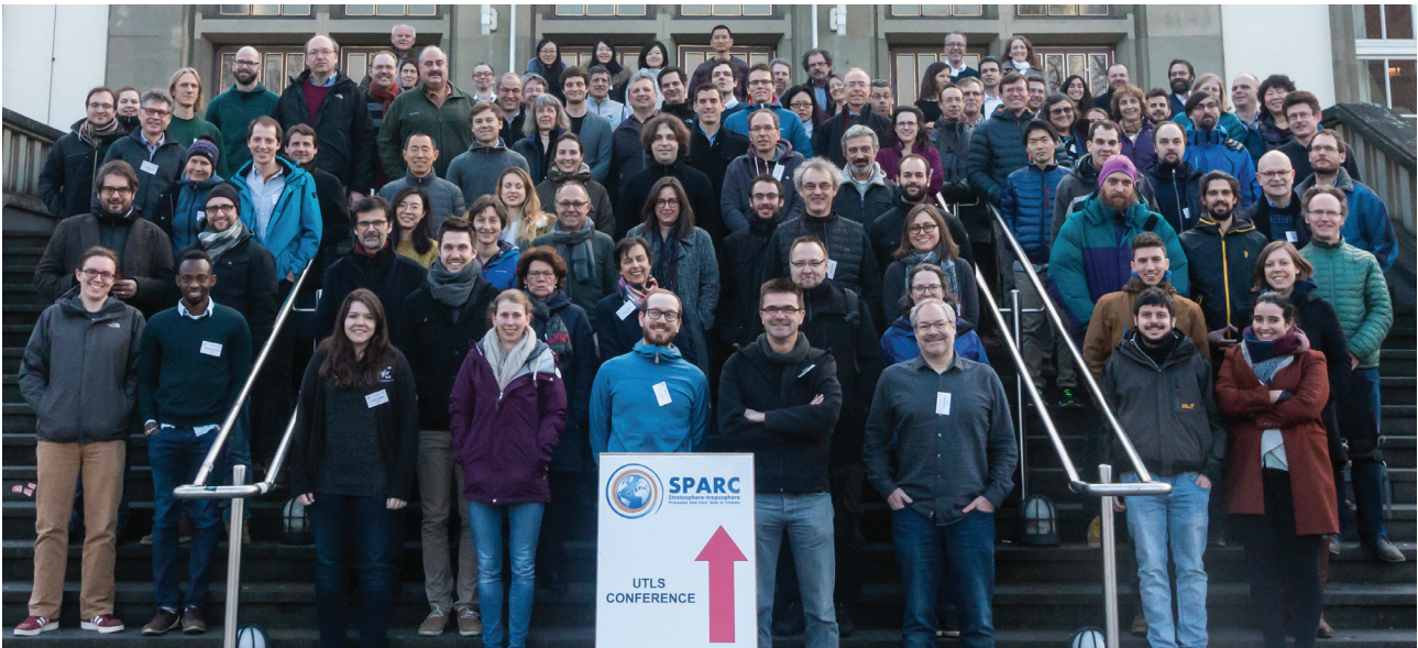
Figure 7: Participants of the UTLS Workshop.