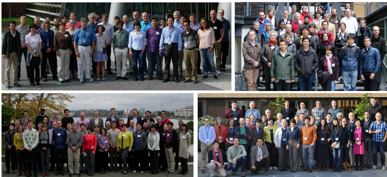
Figure 1.4: Photographs from (top left) the 2014 S-RIP workshop at NOAA at College Park in the USA, (top right) the 2015 workshop at Paris, France, (bottom left) the 2016 workshop at Victoria, Canada, and (bottom right) the 2017 workshop at ECMWF at Reading, UK. These four workshops were held jointly with the SPARC Data Assimilation workshops, and these photographs were taken on the joint-session day.

Each chapter of the report selected co-leads who organised the production of relevant diagnostics and the chapter writing, along with several contributors. The chapter co-leads are listed in Table 1.2 .