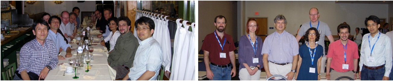
Figure 1.2: Photographs from (left) the 8th SPARC Data Assimilation Workshop at Brussels in 2011 and (right) the 9th SPARC Data Assimilation workshop at Socorro in 2012.