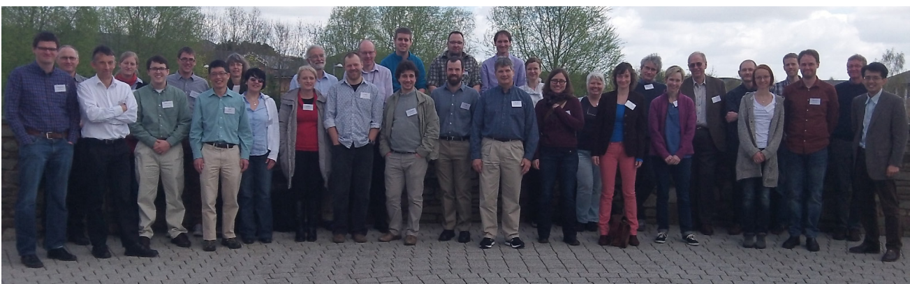
Figure 1.3: Photograph from the S-RIP Planning Meeting at Exeter in 2013.