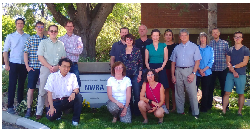
Figure 1.5: Photograph from the 2018 S-RIP chapter-lead meeting at NWRA at Boulder, USA.

Quasi-monthly S-RIP news emails have been sent to the participants and other interested researchers to share the latest information relevant to the project and to keep the volunteer participants motivated. Following the discussion at the 2015 S-RIP workshop, in February 2016 a special issue on “The SPARC Reanalysis Intercomparison Project (S-RIP)” was launched in Atmospheric Chemistry and Physics (ACP), a journal of the European Geosciences Union (EGU).