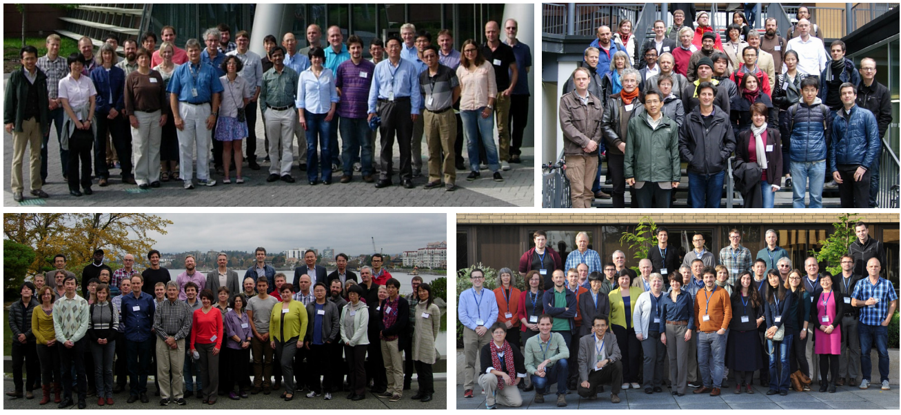
Figure 1.4: Photographs from (top left) the 2014 S-RIP workshop at NOAA at College Park in the USA, (top right) the 2015 workshop at Paris, France, (bottom left) the 2016 workshop at Victoria, Canada, and (bottom right) the 2017 workshop at ECMWF at Reading, UK. These four workshops were held jointly with the SPARC Data Assimilation workshops, and these photographs were taken on the joint-session day.

Each chapter of the report selected co-leads who organised the production of relevant diagnostics and the chapter writing, along with several contributors. The chapter co-leads are listed in Table 1.2 .