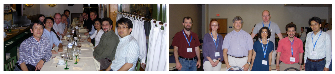
Figure 1.2: Photographs from (left) the 8th SPARC Data Assimilation Workshop at Brussels in 2011 and (right) the 9th SPARC Data Assimilation workshop at Socorro in 2012.