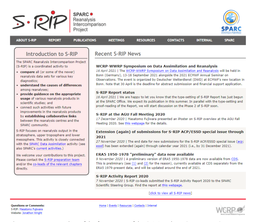
Figure 1.6: A snapshot of the front page of the S-RIP website (7 May 2021).

S-RIP has close links to several other SPARC activities, including the SPARC Data Assimilation Working Group (SPARC-DA), the SPARC Network on Assessment of Predictability (SNAP), SPARC Dynamical Variability